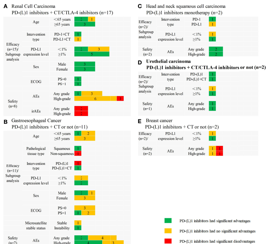
FIGURE 3 | Subgroup analyses and safety results in other cancers. (A) PD-(L)1 inhibitors plus chemotherapy/cytotoxic T lymphocyte associated antigen 4 pathway inhibitors versus chemotherapy in renal cell carcinoma; (B) PD-(L)1 inhibitors plus chemotherapy or not versus chemotherapy in gastroesophageal cancer; (C) PD-(L)1 inhibitors monotherapy versus chemotherapy in head and neck squamous cell carcinoma; (D) PD-(L)1 inhibitors plus chemotherapy/cytotoxic T lymphocyte associated antigen 4 pathway inhibitors or not versus chemotherapy in urothelial carcinoma; (E) PD-(L)1 inhibitors plus chemotherapy or not versus chemotherapy in breast cancer. CT, chemotherapy; CTLA-4, cytotoxic T lymphocyte associated antigen 4; n, the number of included systematic reviews; ECOG, Eastern Cooperative Oncology Group; PS, performance status; AEs, adverse events; irAEs, immune-related adverse events; High-grade, \geq 3 grade.

One SRs assessed the efficacy and two SRs assessed the safety of PD-(L)1 inhibitors plus CT or not in treating breast cancer. The results indicated PD-(L)1 inhibitors plus CT did not