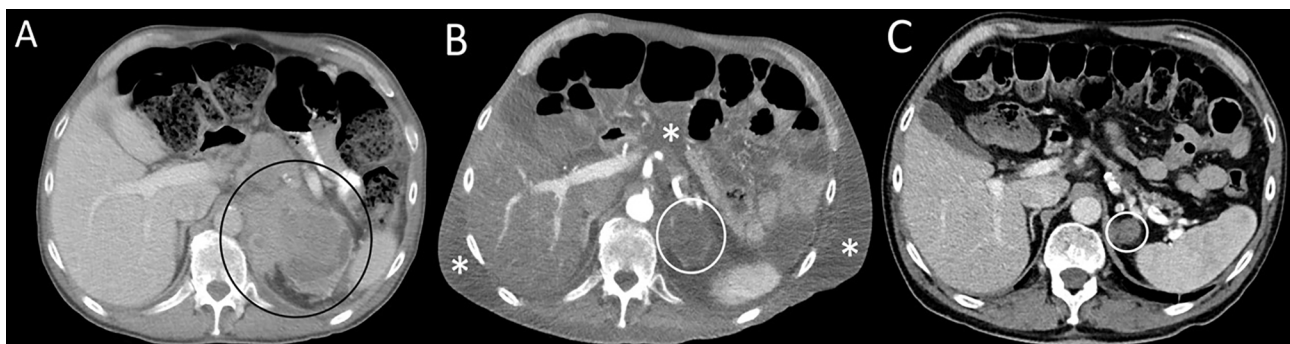
FIGURE 1 | Serial axial computed contrast-enhanced computed tomography (CT) images of the upper abdomen demonstrate (A) a left adrenal mass (circle) 4 months before admission and prior to treatment, (B) decreased tumor size by more than 50% (circle) as well as new-onset ascites and soft tissue edema (asterisks) at the time of hospital admission following therapy with combination immune checkpoint inhibitor therapy; (C) resolution of ascites and soft tissue edema and continued tumor response (circle) 8 months after admission. The patient was not receiving therapy at the time of the follow-up CT.