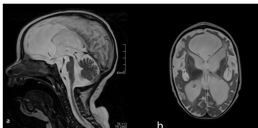
FIGURE 3 (A) Follow-up brain MRI scans (T2 sagittal and axial plane) after 1 year: severe atrophy of midbrain compared with initial MRI. (B) Severe reduction of brain volume and abnormal signal of the white matter—leucoencephalopathy.

A heterozygous c.2159G>A (p.Arg720Gln) mutation in the IFIH1 gene (NM_022168.4) has been previously identified in six individuals with a severe AGS phenotype and its functional effect has been demonstrated by IFN scoring (2, 5, 17, 18). Rice et al. reported two patients with intrauterine growth restriction and thrombocytopenia at birth who had severe developmental delay.