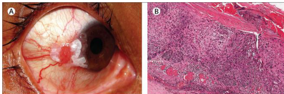
FIGURE 3 | (A) Observation of limbal ocular surface squamous neoplasia along with keratin plaque in patient suffering from Crohn's disease (B) Histopathology of invasive squamous cell carcinoma post excision of the tumour using hematoxylin and eosin stain.

Other rare manifestations include central retinal vein occlusion, vasculitis, peripheral corneal ulcers, corneal infiltrates, central serous chorioretinopathy and retinal detachment. Keratopathy