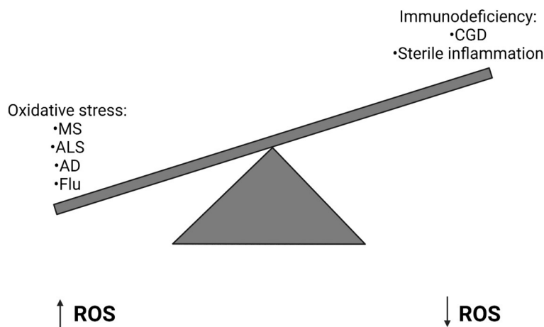
FIGURE 2 | Imbalanced Reactive Oxygen Species generation can have implications for human health. High levels of Reactive Oxygen Species (ROS) can result in oxidative stress, which can lead to a number of diseases including Multiple Sclerosis (MS), Amyotrophic Lateral Sclerosis (ALS), Alzheimer's Disease (AD) and Influenza. Alternatively in primary immunodeficiencies, such as Chronic Granulomatous Disease (CGD), where a genetic defect means ROS are not generated, sterile inflammation often develops.