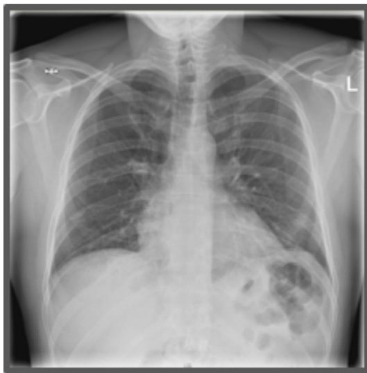
Day 6 after positive SARS-CoV-2 antigen test (before 2 nd apheresis)