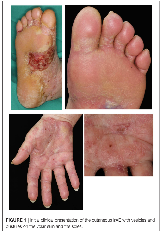
FIGURE 1 | Initial clinical presentation of the cutaneous irAE with vesicles and pustules on the volar skin and the soles.

Prior to the diagnosis of melanoma, the patient had been otherwise fit with no significant co-morbidities. After 11 cycles of nivolumab, the patient developed thyroid peroxidase (TPO) autoantibodies, heralding the development of an immune-mediated thyroiditis which ultimately required substitution therapy with thyroxine. Concurrently, the patient developed small vesicles and pustules on the medial aspects of her palms and soles ( Figure 1 ). Despite the application of topical