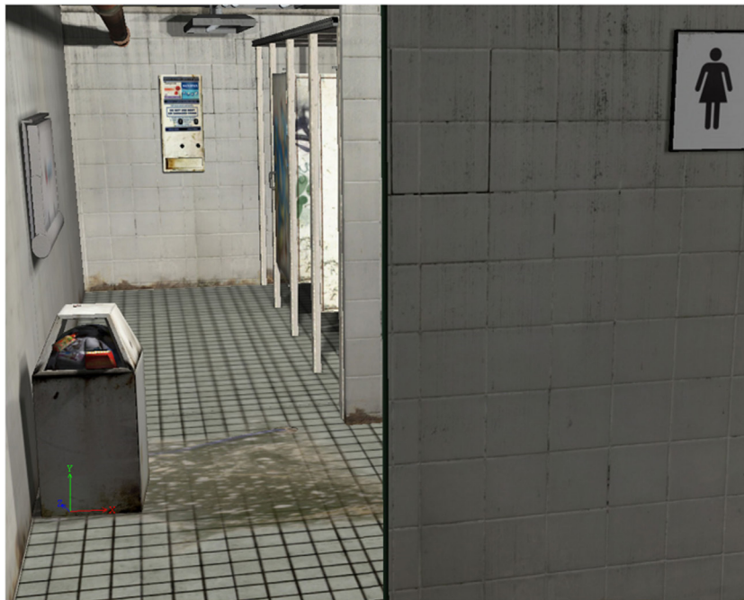
FIGURE 2 | Screenshot of the women’s restroom in the “contaminated” virtual environment.