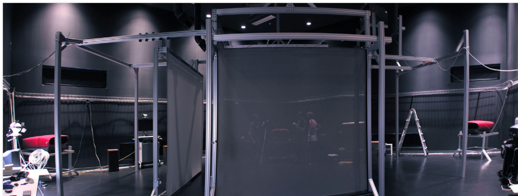
FIGURE 1 | Psyche , the six-wall immersion chamber at UQO's Cyberpsychology Lab (Gatineau, QC, Canada).

The experiment took place in a six-sided wireless immersion chamber (CAVE-like), called Psyche , located at the Laboratoire de Cyberpsychologie de l'Université du Québec en Outaouais, Gatineau, QC, Canada ( Figure 1 ). This VR immersion system is made of six projected surfaces: four walls, the floor, and the ceiling. The back wall is mounted on rails and can be closed once the participant is inside the cube. Each wall measures 8.6' and receives images from a Viztek 1 projector (modified from Electrohome Marquee 8500) located 15 ft away. Each CRT projector projects 225 ANSI lumens in 1280 \times 1024 @ 100 Hz resolution, providing a seamless active stereoscopic display. Psyche is operated with a wireless keyboard through a cluster of six computers controlled by a master computer, all running Virtool VPPublisher Unlimited 5.0 and built with the following specifications: Intel® Core 2 Quad Q6600@2.40GHz with 4 GB of RAM, Nvidia® Quadro FX 5500G frame-locked graphics card with 1024 MB of VRAM, an Intel® D975XBX2 motherboard, and Windows® XP Pro 32 Bit Service Pack 2 . The library uses OpenGL 2.0 Stereo. The master computer also has a Creative® SoundBlaster X-Fi sound card. The computer cluster includes one more computer to link the IS-900 VET Intersense® wireless inertial tracking sensor with the virtual environment on VRPN 7.18 using a Pentium 4 3.20 GHz CPU