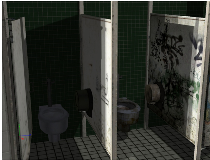
FIGURE 3 | Two toilet stalls featuring different levels of dirtiness in the “contaminated” virtual environment.