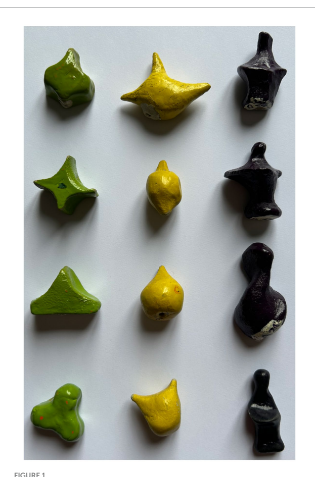
Meaningless shapes used in the test for morphoagnosia (Bottini et al., 1991).

To qualitatively investigate the patient's mental representation of an object explored by touch, we asked the patient to manipulate a