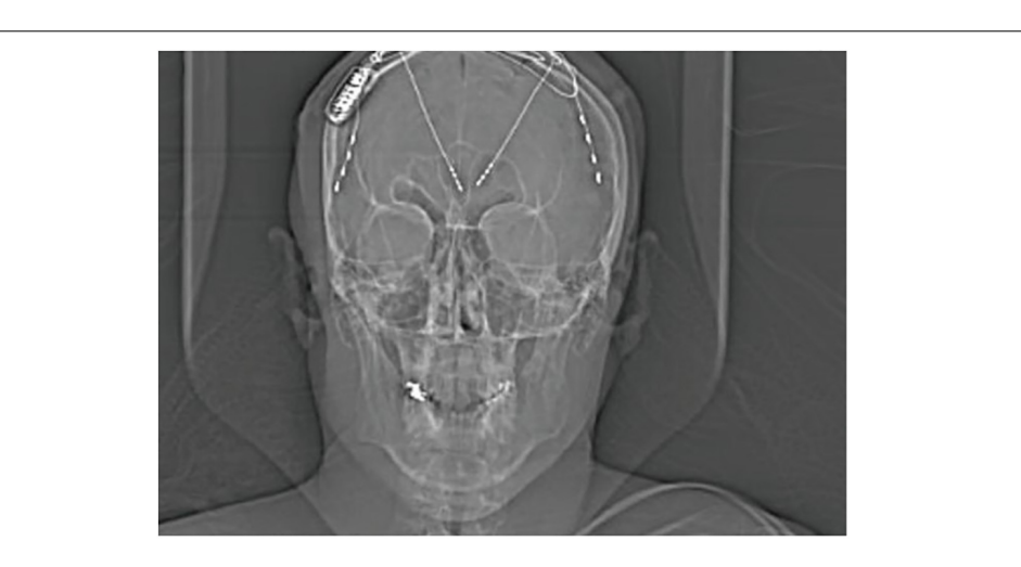
FIGURE 2 | X-ray displaying the implantation of RNS device with 2-depth electrodes each with four contacts targeting the ANT and 2-strips in the prefrontal cortex of a 34-year-old patient with genetic generalized epilepsy; only the right ANT depth and right cortical strip were attached to the RNS device. Adapted with permission from Herlopian et al. (2019).

Kokkinos et al. (2020) implanted RNS leads in the centromedian/ventrolateral (CM/VL) nuclei of a 19-yearold female with eyelid myoclonus plus absences who failed numerous AEDs. The patient received bilateral 4-contact RNS leads with the distal contacts at the CMT and most proximal contacts in the VL nuclei. One-year scalp EEG follow-up verified successful CM/VL stimulation by RNS during generalized spike-wave discharges. Within 18-months of closed-loop CM/VL stimulation, the patient had improved from an average 60 seizures/day to fewer than 10. This was the first report of successful thalamic RNS to treat absence seizures.