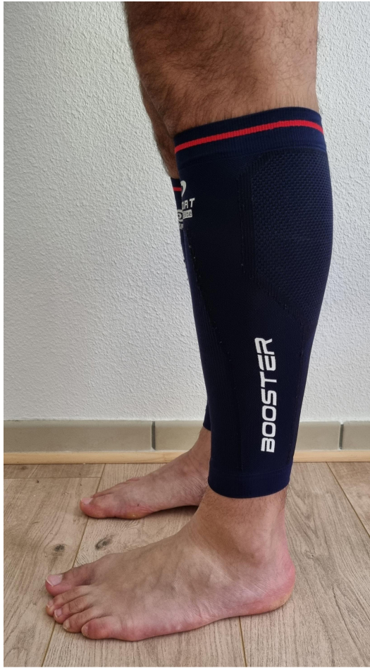
FIGURE 1 | Compression sleeves worn by participants in the compression garments (CG) condition.

proposed by Read et al. (2018) and Fort-Vanmeerhaeghe et al. (2020), an asymmetry index (ASY) between both legs was then calculated for each center of pressure parameter (ASY_VX, ASY_VY, ASY_S) as follows: