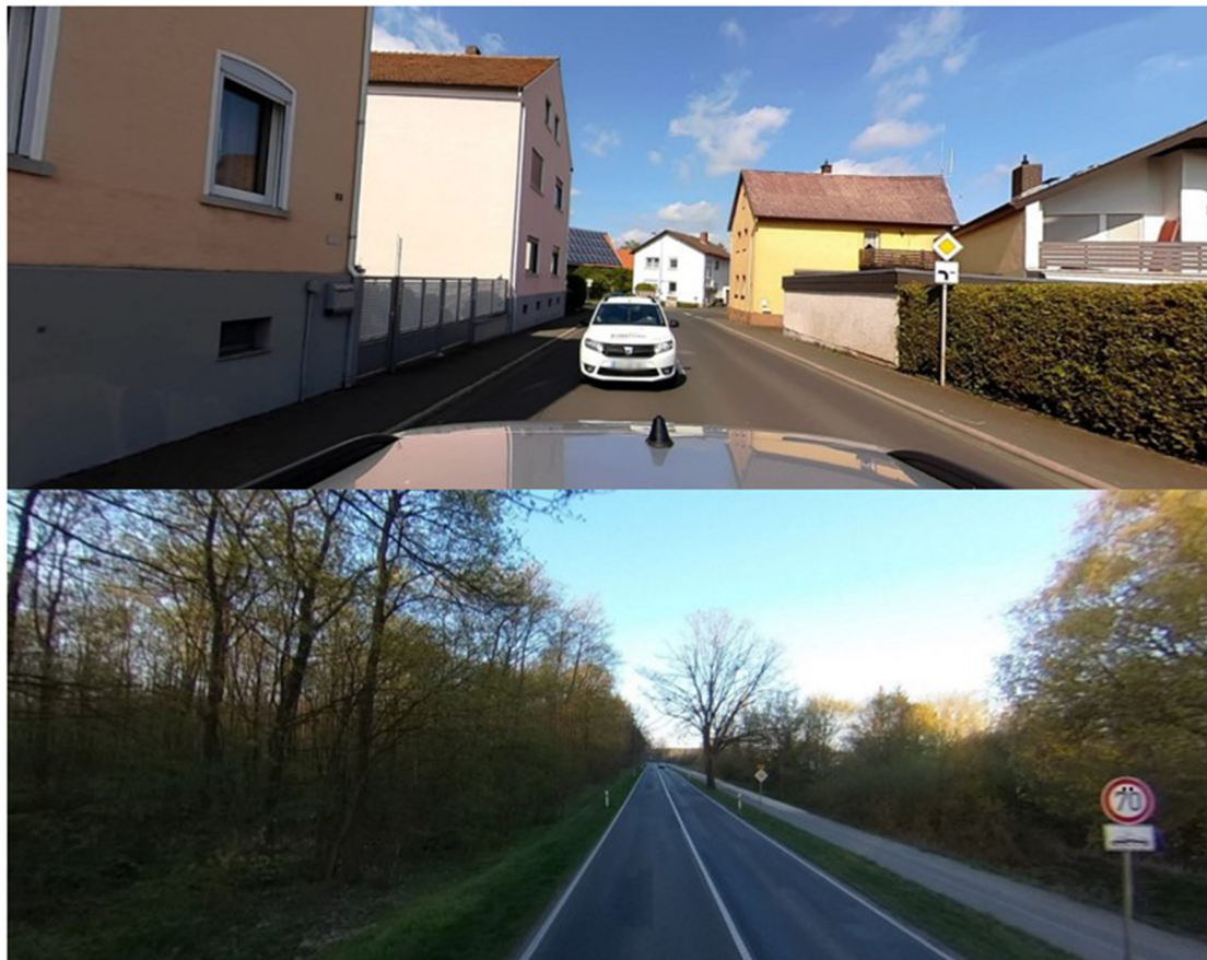
FIGURE 2 | Example of rule 1 stimuli with approaching traffic (top picture) and rule 2 stimuli (bottom picture) with an umlaut (located on speed limit sign).

tension, anger, fatigue, depression, esteem, vigor, and confusion. Subjects also completed the POMS at the end of the experimental visit to assess any possible affective changes induced by tDCS or the experimental task.