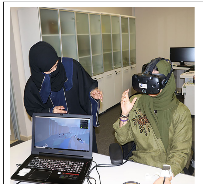
FIGURE 2 | Researcher with a student volunteer participant during the laboratory pain study (photo and copyright Hunter Hoffman, UW, www.vrpain.com ).

virtual object target (e.g., a virtual snowman) in the VR goggles. The SnowCanyon virtual environment 5 presents a virtual arctic canyon to the user, complete with flowing river below, blue sky above, and terraced canyon walls to the sides containing virtual penguins, igloos, and snowmen (see Figure 1 ). Subjects in both treatment conditions wore an HTC VIVE VR helmet head-mounted display with an integrated SMI eye tracking system (see Figures 2, 3 ). For all participants in the current study, sound was muted and the helmets were immobilized (no head tracking), as an analog to the robot-like articulated arm goggle held eye-tracked VR goggles that will eventually be used with actual burn patients in future clinical studies. The eye-tracking interactions in the VR game were designed to be easy for the