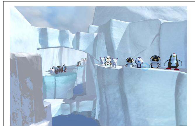
FIGURE 1 | A still shot from SnowCanyon.

The VR system was carried out using a gaming laptop: MSI GeForce GTX 1080 8 GB, Intel Core i7 7th (2.80 GHz), 16 GB RAM, Windows 10 operating system connected to an SMI HTC VIVE VR helmet with FOV 110° from HTC, with 1080 × 1200 pixels per eye resolution and a refresh rate of 90 Hz. The head mounted display VR helmet, integrated with SMI eye-tracking 250 Hz, works with the SDK C + + \C# for various VR engines like Unity. A new VR world, SnowCanyon 5,6 was integrated with the eye tracking hardware, enabling participants to use the eye-tracker to select a virtual object by simply looking at the