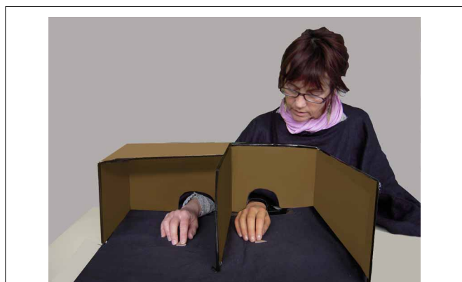
FIGURE 1 | Experimental set up, seen from experimenter’s viewpoint.

Participants placed their right hand inside the cardboard box; they placed their index finger on a mark. They could see the rubber hand (here on the right part of the Figure) but not their real hand.