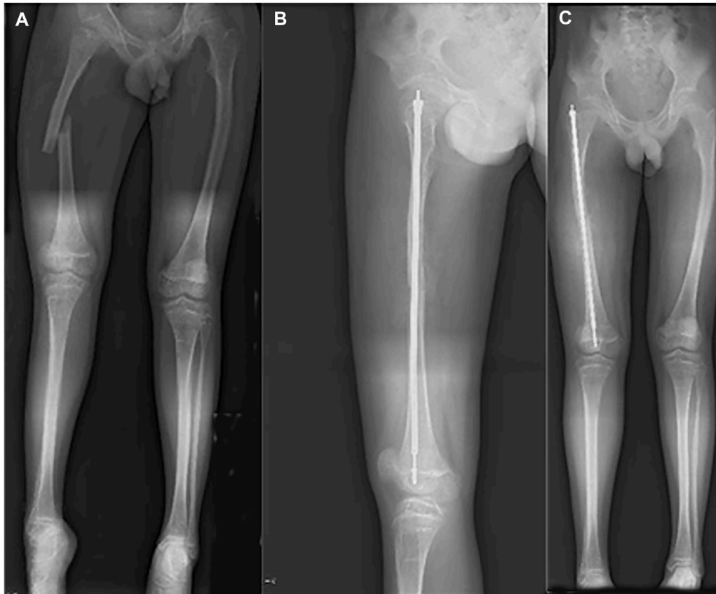
FIGURE 4 | Radiograph of 13-year-old boy with right femoral fracture. (A) Full-length AP view of lower extremity before surgery. (B) Lateral of femur after surgery. (C) Full-length AP view of lower extremity after surgery.

children and their parents, and the samples were sequenced by Xiamen Jiyuan medical laboratory. Subsequently, we extracted the whole genomic DNA of peripheral blood leukocytes, built the DNA library, and carried out 150 bp double terminal sequencing. After analyzing the original data of sequencing by biological information, the detected single nucleotide polymorphism and indel variants were annotated by ANNOVAR software.