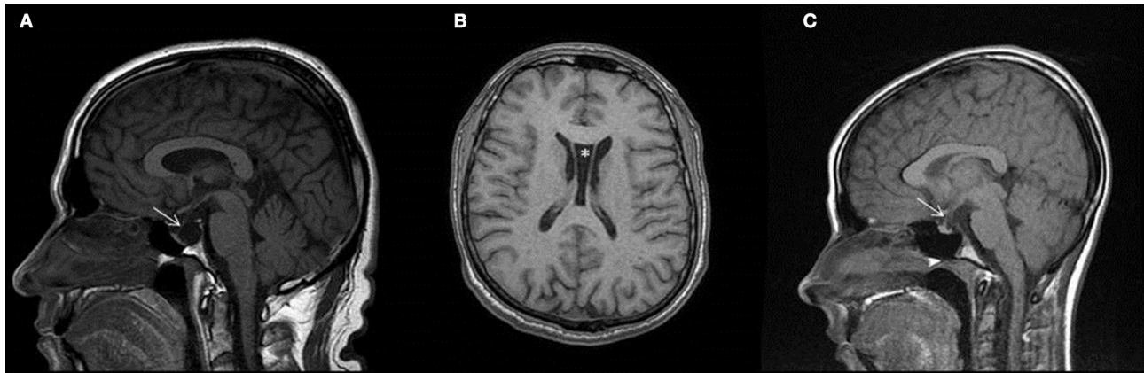
FIGURE 2 | Brain MR images of the examined patients. T1 weighted images of Patient II/2 ( A,B ), and of Patient III/1 ( C ). Image ( A ) and ( C ) demonstrate empty sella on sagittal images. Infundibulum sign is identifiable (arrows), thus proving empty sella vs. cystic mass of pituitary.

hormone (GH) level was performed at age of 13 years. No GH elevation was detected (GH remained under 10 ng/mL). Brain MRI showed an empty sella ( Figure 2 ). She received subcutaneous GH between the age of 13–17 years, and she reached a normal height. TSH level was normal. During elementary school, the performance was always somewhat below the average. An educational psychologist diagnosed dyslexia, with normal IQ. Later at age of 18 years, marginal IQ was measured (83 points in the Wechsler test 83). She started high-school education, but was unable to keep up with lectures. Around the age of 18 years, psychiatric symptoms emerged with exaggerated anxiety, depression and suicidal temptation. She was treated with a transient psychotic episode after an induced abortion, because of unwanted pregnancy. Former candidate genetic studies were negative (SCA1,2,3 repeat expansion, GNAL, RELN, DYT11, DYT5, DYT14 sequencing). Elements of the neurologic examination at age of 20 years are shown on the Supplementary Video S2 . Mild microcephaly, underdeveloped secondary sex characteristics, and joint hypermobility were noticed. Continuous choreiform movements were detected in the head, trunk and extremities, with superimposed myocloni. Dysarthria was noticeable as well. Mild spasticity and Babinski sign was detected in the right lower limb. Ataxia was not present.