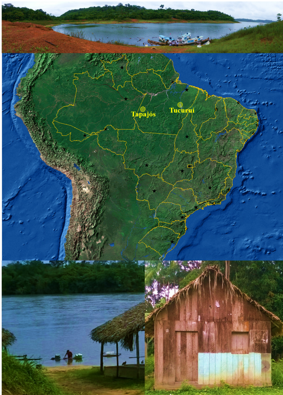
FIGURE 1 | Map of Brazil (obtained from the Instituto Brasileiro de Geografia e Estatística, Brazil) showing the States and their capitals ( black stars ). Yellow circles indicate the locations ( -4.287121, -55.984106 , and -3.800897, -49.811848 ) of riverine populations participating of this study. Photographs illustrates some conditions of the riverine populations: difficult access ( above ), river as a key element ( below left ) and precarious facilities ( below right ).