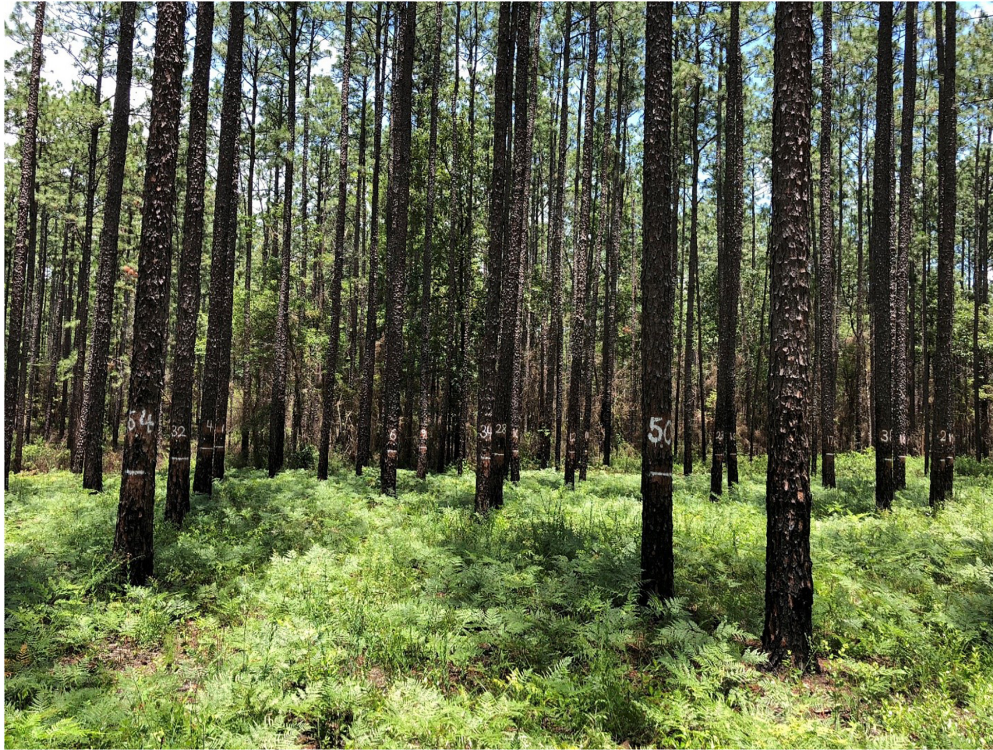
FIGURE 1 | An example of a 0.1 ha measurement plot in a winter biennial burn treatment.