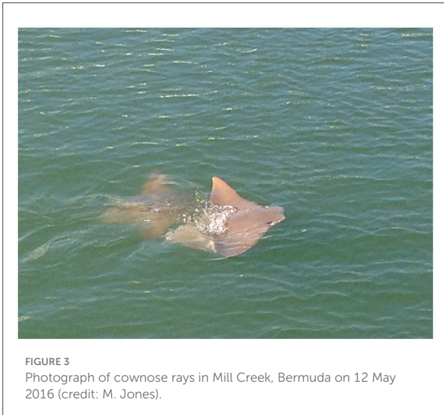
FIGURE 3 Photograph of cownose rays in Mill Creek, Bermuda on 12 May 2016.