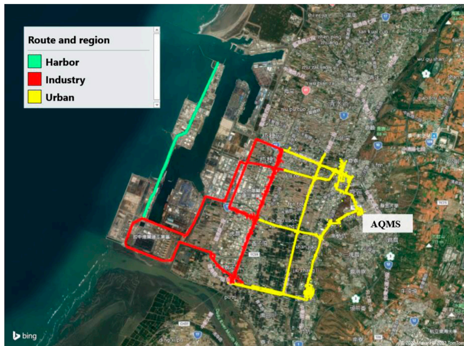
FIGURE 2 | MMS sampling route in the three regions: urban (yellow), industrial (red), and harbor regions (green).