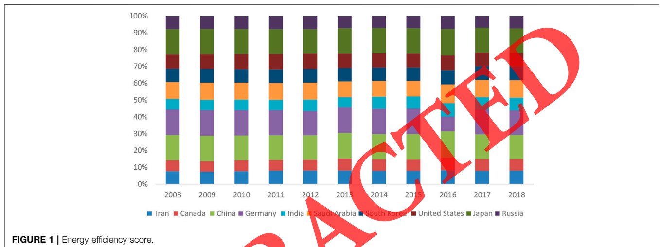
FIGURE 1 | Energy efficiency score.

As can be seen in Table 4 , the ten countries with the highest CO 2 emissions have the best energy efficiency. Coal's demand may rise if crude oil's price rises because there are so many alternatives in the energy sector, such as natural gas and electricity. To keep this from happening, the cost of all nonrenewable resources must be raised proportionately, and consumers must be subsidized or otherwise encouraged to switch to more efficient renewable energy sources. Countries that emit the most carbon dioxide per capita are Saudi Arabia (third), Japan (fourth), and China (sixth). Similarly, Russia has the highest primary energy consumption efficiency, with a score of 0.449, making it the country with the highest energy intensity. The time coefficient indicates that technological advancements will lead to an increase in energy consumption. As a result, policies aimed at raising the cost of energy can help reduce energy intensity. Because of the low cost of energy, businesses and factories are not investing in energy efficiency or energy-efficient technologies properly. An illustration of the energy efficiency score's visual representation can be seen in Figure 1 . Since companies are spending so much money on new technologies, the technological gap between developing and developed countries has grown. Energy efficiency can be affected by changes in oil prices, according to our findings. Restrictions on oil and gas prices have been a flashpoint for