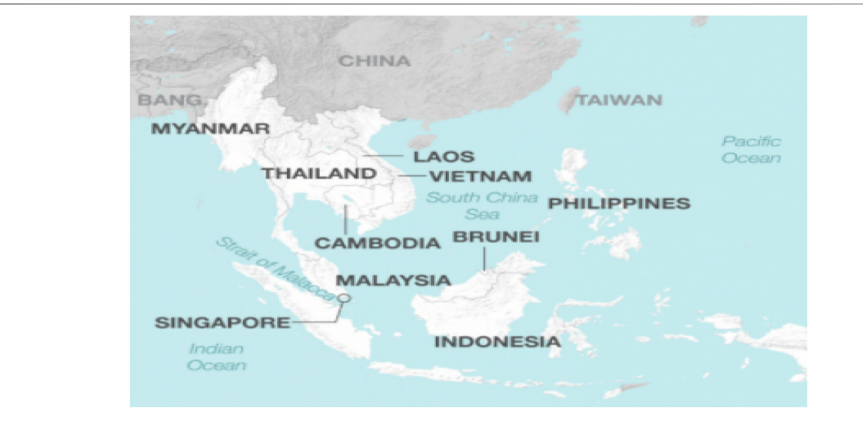
FIGURE 1 | Geographical importance of ASEAN.

Figure 1 exhibits the geographical importance of the ASEAN region. The ASEAN countries collectively have a population of 650 million people. It is a regional group that brings diverse neighbors together to solve economic, security, and political concerns. It has been a driving force behind Asian economic integration, pushing efforts to establish one of the world's biggest free trade blocs and negotiating six free trade agreements with other Asian economies (Maizland and Albert, 2020).