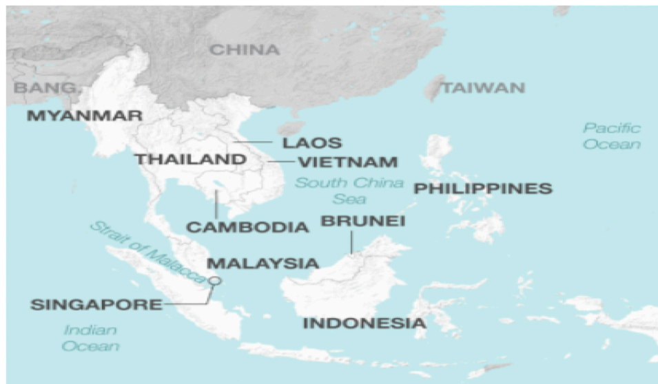
FIGURE 1 | Geographical importance of ASEAN.

Figure 1 exhibits the geographical importance of the ASEAN region. The ASEAN countries collectively have a population of 650 million people. It is a regional group that brings diverse neighbors together to solve economic, security, and political concerns. It has been a driving force behind Asian economic integration, pushing efforts to establish one of the world's biggest free trade blocs and negotiating six free trade agreements with other Asian economies (Maizland and Albert, 2020).