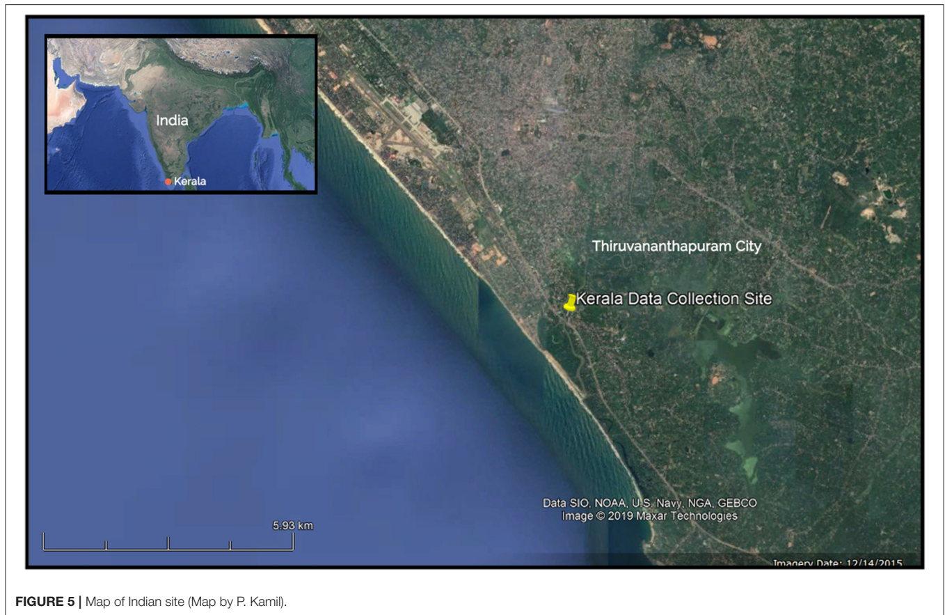
FIGURE 5 | Map of Indian site (Map by P. Kamil).