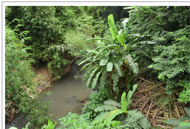
FIGURE 6 | An example of an unsafe riverbank in the Tukad Badung River transition zone area. It is full of detritus, raising the possibility of exposure to reptiles, particularly snakes. Detritus covers the land structure underneath, increasing the risk of accident if the underlying ground is not solid enough for debris collection. There is also no human access to the area.

relatively accessible site along the Karamana river in India, shown in Figure 7 .