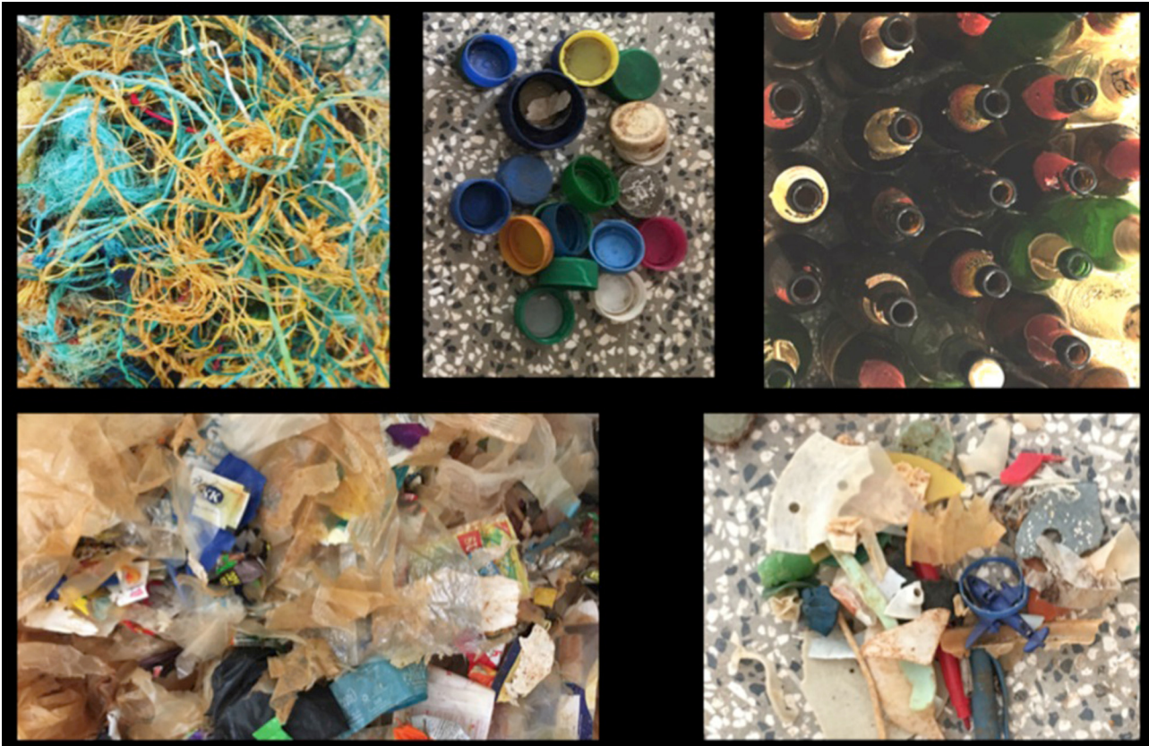
FIGURE 2 | Examples of some distinct categories including (clockwise from top left) nylon cords and ropes, plastic bottle caps, glass bottles, hard plastic fragments, filmed plastic fragments.

equipment includes: GPS, 100 M measuring tape, gloves, scales (hanging scale and more precise scale for smaller items), clipboards, paper, writing instruments, collection bags, boots, sunscreen, drinking water, and insect repellent. Often, large-scale cleanups are used to educate the public about littering and debris, to collect data, or to clean rivers. This methodology does not propose to clean an entire river system, but instead to harness the work of a small team to better understand local debris. It can be completed with a small team of researchers in a few hours. It does allow for a consistent and replicable scientifically valid way of collecting material in a range of settings. This method enables: