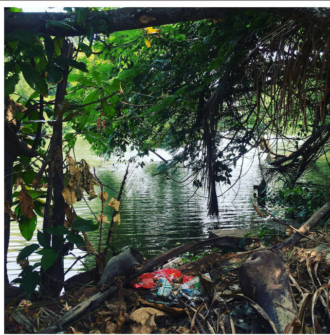
FIGURE 7 | This area became part of the site for collection along the Karamana River. While brush and debris exists along the water's edge, the ground is solid and the approach is flat (Photo by K. Owens).

do, and by doing so, add to the knowledge on the fate of debris and the missing plastics question. This method allows for the production of data that can help us understand how debris accumulates along global rivers. When rivers flood, a great deal of this debris makes its way from riversides into oceanic systems or may be pulled from riverside dumping areas into freshwater systems. Better data about river shorelines can help us holistically understand the issue of marine debris— which should more broadly be considered the problem of global plastic pollution. The benefits of this method are many. It allows for consistent, replicable data gathering at sites around the world. Because of the size limitations, the work can be managed in a relatively short amount of time with a small group of researchers or volunteers. The goal of this method in application is not to clean the world's