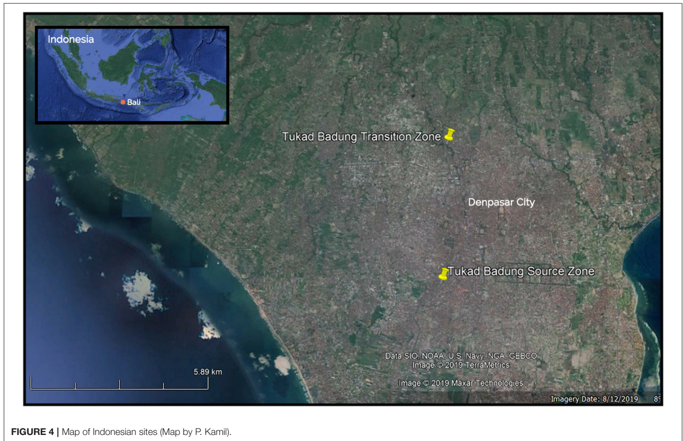
FIGURE 4 | Map of Indonesian sites (Map by P. Kamil).