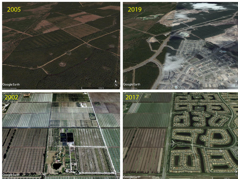
FIGURE 2 | Land use transitions to residential development highlight the use of wet detention ponds for stormwater management in the coastal zone. Upper panel: outside Charleston, South Carolina, 33°3'33.01"N, 80°8'48.85"W in the Sawmill Branch Creek watershed (HUC12: 030502010601); lower panel: outside Boca Raton, FL, 26°30'35.22"N, 80°11'29.72"W, in the Hillsborough Canal watershed (HUC12: 030902061101). Stormwater ponds in the two developed panels to the right side are visible in the form of dark areas surrounded by homes/buildings. In the upper-right panel, two large ponds are visible near the center, while many ponds (round or elongated) are visible in the lower-right panel. Upper-right panel, through partial cloud cover, also shows expansion of new developments with clear cutting and re-grading of the pre-existing managed-forested landscapes, and a borrow pit is found in the top-left corner. The lower-left panel also shows (at bottom-center) prior agricultural use of ponds.