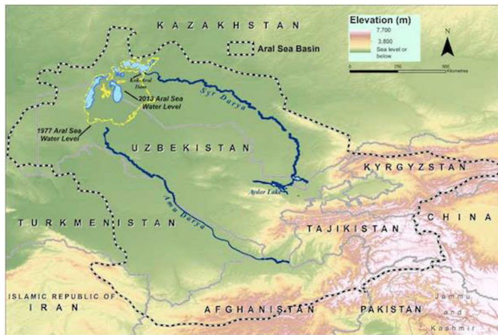
FIGURE 4 The Aral Sea Basin. Map compiled from (Micklin, 2007; Gaybullaev et al., 2012); Landsat satellite imagery from USGS/NASA; Digital Elevation Model from USGS EROS; visualization by UNEP/GRID-Sioux Falls.