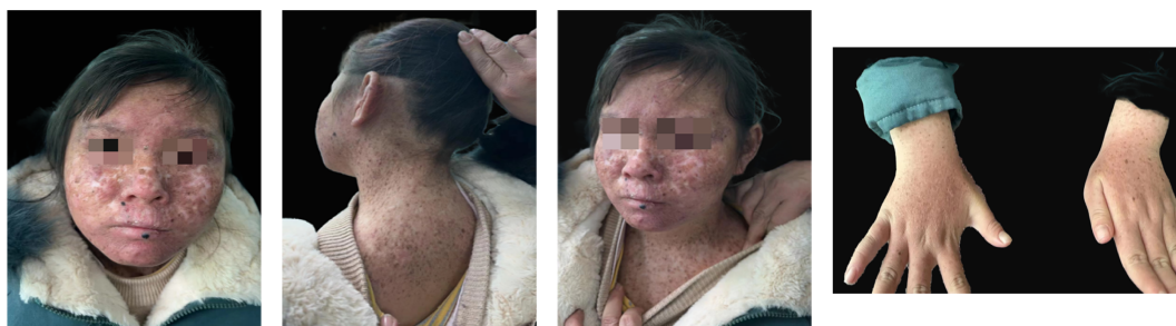
FIGURE 1 Clinical imaging.

In this reported case, it was confirmed that the disease-causing mutation was detected in XPA, which was verified to be the most common subtype in China (9). The detected pathogenic variant of the case resulted in the dysfunction of XPA. Reportedly, XPA plays a vital role in nucleotide excision repair (NER). The NER pathway is the most