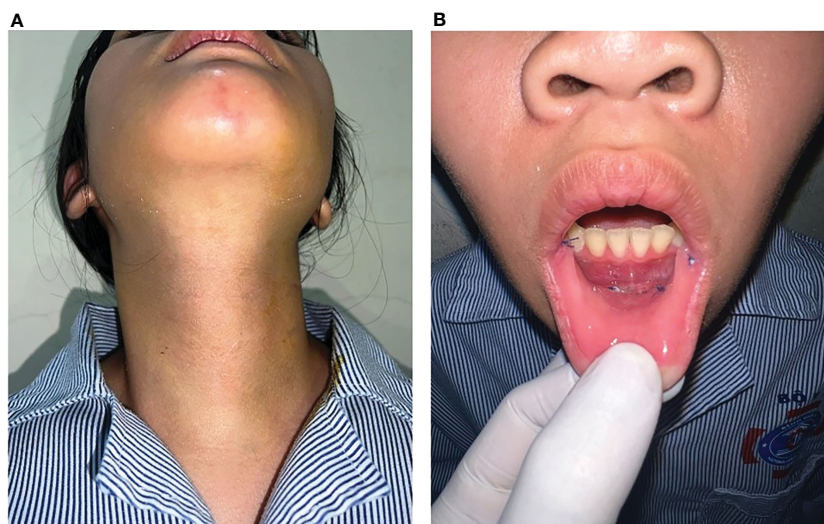
FIGURE 3 (A) The picture of anterior neck three days after surgery; (B) The patient’s vestibular area three days after surgery.