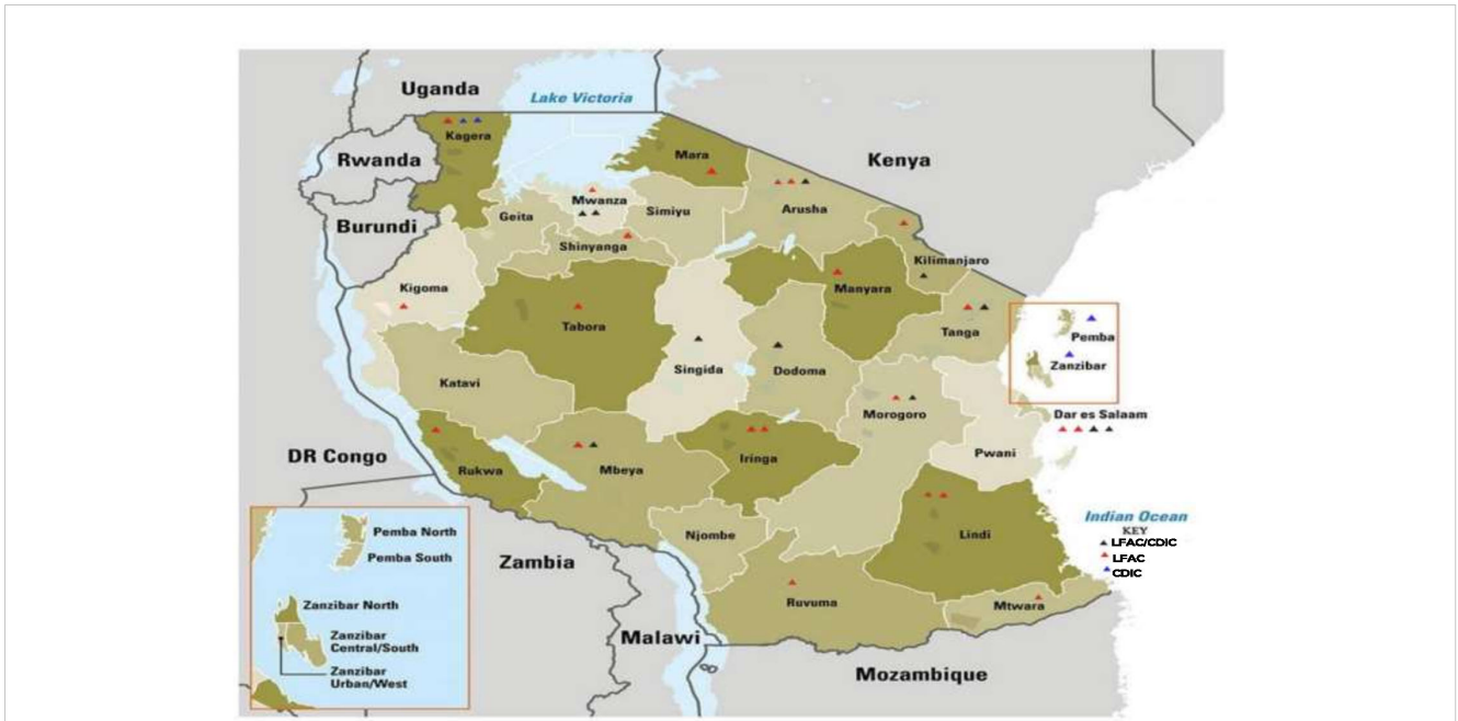
FIGURE 1 Geographical coverage of the type 1 diabetes clinic in Tanzania.

values, which might have been used when HbA1c values were lacking. As a rule, even the most basal clinical information was lacking. A lot of missing data might, to some extent, be a reflection of limited resources, but even more an insufficient awareness and low priority among health care professionals.