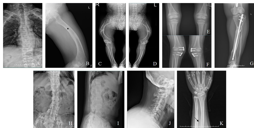
FIGURE 2 (A) Vertebral compression fractures (Family 5/III-8, a man aged 42). (B): Pseudofracture line (Family 4/III-17, a man aged 22). (C, D) Fractures in the femur (Family 5/III-8). (E) Radiograph of bilateral knee (Family 2/II-4, a boy aged 5). (F) Radiograph after hemiepiphysiodesis (Family 9/II-3, a girl aged 7). (G) Radiograph after osteotomy (Family 14/III-6, a woman aged 24). (H-J) Ossification of the spinal ligaments (Family 14/II-3, a woman aged 50). (K) Ossification of the interosseous membrane of the forearm (Family 6/II-4, a woman aged 30).

Manifestations and complications in adult patients are summarized in Table 2 and Figure 2. The majority of patients (12/14) had tooth loss, and half of them reported a history of repeated infections of their teeth, including endodontic infections and periodontitis. Pathological fractures and pseudofractures were detected in four adult patients (including three male patients and one female patient). The common fracture sites were the femur, tibia, and vertebrae. Secondary hyperparathyroidism was detected in seven patients and four patients were diagnosed with ectopic ossification in the spinal ligament, Achilles tendon, and interosseous membrane of the forearm. Before genetic diagnosis, eight patients received