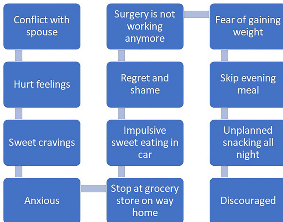
FIGURE 1 | Negative behavioral chain analysis.

Lastly, it is impossible to avoid foods associated with rewards completely, and experiencing urges, cravings, or impulses to eat is a normal part of the human experience. Therefore, developing management strategies for these inevitable situations is necessary. ACT incorporates concepts of defusion and urges surfing to manage impulsive eating behavior (80). Defusion is a concept that suggests viewing urges to eat as a normal part of an internal appetitive experience, and patients have a choice whether to act on the associated thoughts, feelings, and physical sensations. Stated differently, defusion encourages becoming aware of the actual thought process around