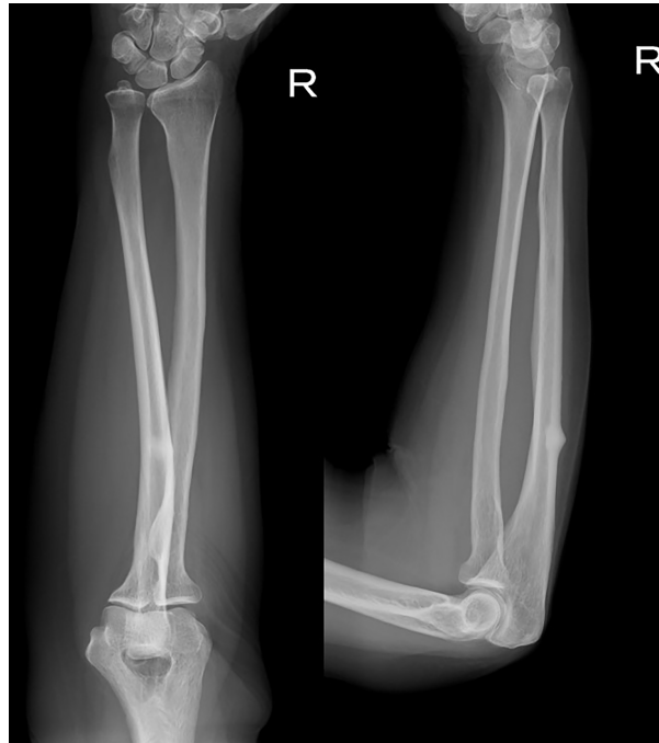
FIGURE 1 | Radiograph at time of diagnosis. Periosteal and endosteal thickening of the dorsal cortex and sclerotic changes in the proximal third of the ulna.