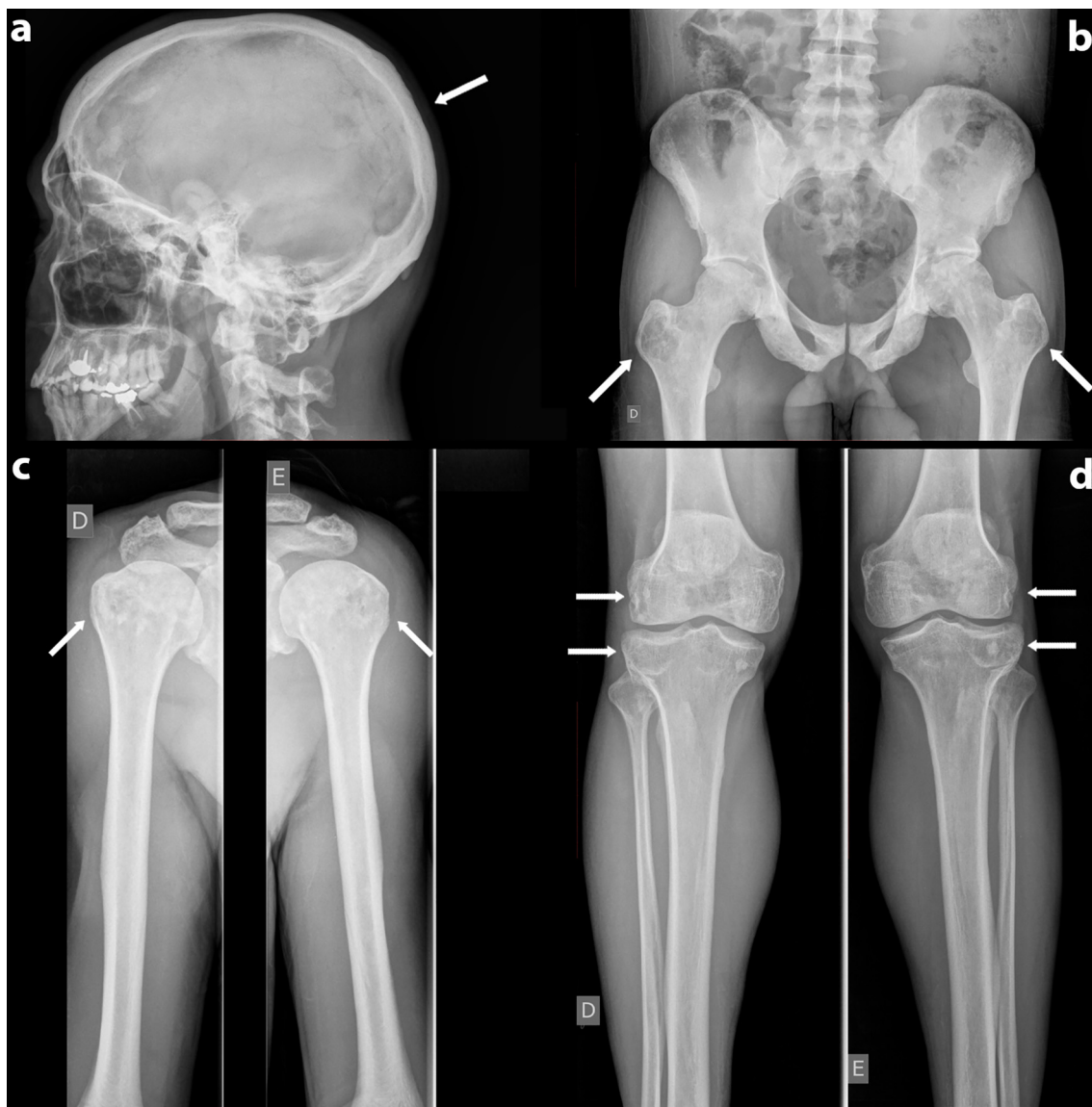
FIGURE 1 | (A) Normal skull radiography. (B) Anteroposterior radiography of the pelvis Symmetric radiolucency with cystic aspect in greater trochanter bilaterally. (C) Anteroposterior radiography of upper limbs- heterogeneous bone density in humeral heads bilaterally with the presence of sclerosis and radiolucent areas. (D) Anteroposterior radiography of lower limbs-pseudo-poikilosis (patchy sclerotic lesions) and radiolucency in distal metaphysis of right and left femur and in proximal region of tibia bilaterally.

glucose of 108 mg/dl, and serum AP of 218 U/L (range, 65–300 U/L). A new skeletal survey was performed. Skull x-ray revealed a homogeneous increase in cranial cap density. There was no thickening of the cranial vault ( Figure 1A ). There was no evidence of focal sclerosis or trauma. Cervical, thoracic, and lumbar spine x-rays also revealed increased vertebrae density without signs of focal trauma. Upper-limb x-rays showed heterogeneous density in humeral heads bilaterally, with the presence of sclerosis and radiolucent areas ( Figure 1C ). This pattern was also present in pelvis, distal metaphysis of right and left femur and in proximal region of tibia ( Figures 1B, D ). In the hip x-ray, there was a sclerosis in the pubis, ischius, and iliaco, as