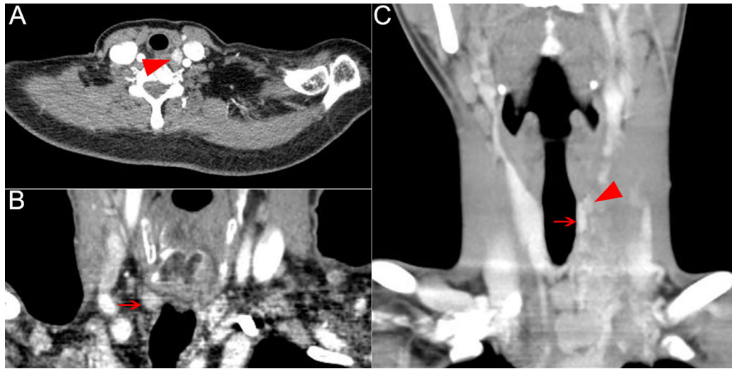
FIGURE 2 | Recurrent nodal disease in RLNIZ diagnosed by enhanced computer tomography. (A) Recurrent nodal disease in RLNIZ in case 1. (B) Residual thyroid tissue in RLNIZ without tumor foci. (C) Recurrent nodal disease and residual thyroid tissue with tumor foci in RLNIZ in case 4. Red arrowhead: recurrent nodal disease; red arrow: residual thyroid tissue. RLNIZ, recurrent laryngeal nerve inlet zone.