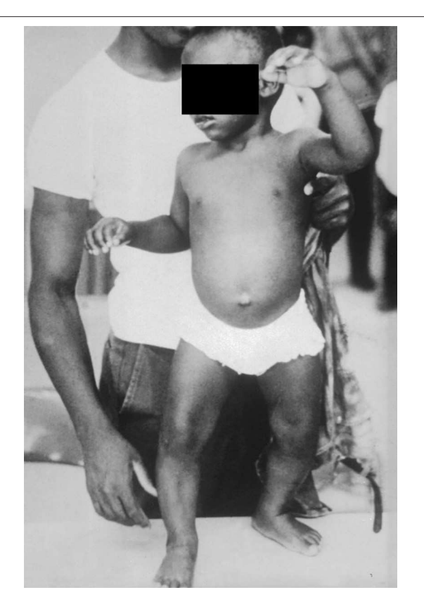
FIGURE 2 | Child suffering from vitamin D deficiency rickets in 1970—image obtained from the Center for Disease Control via the Public Health Image Library (PHIL) at https://phil.cdc.gov/phil/details.asp (open access).

Wheeler et al. A Brief History of Nutritional Rickets