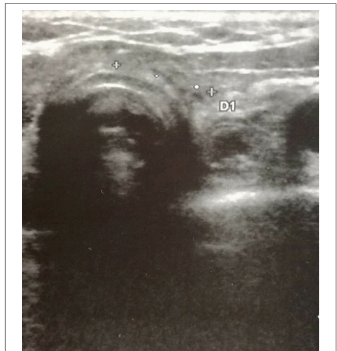
FIGURE 3 | Neck ultrasonography performed at 10-month follow-up visit after the second cycle of intravenous methylprednisolone treatment shows complete regression of the two hypoechoic areas in the thyroid bed.

To explain the exceptional association of these two different diseases, different pathogenetic hypotheses may be postulated. Firstly, PG can be a paraneoplastic manifestation of an underlying tumor, particularly haematolymphoid malignancies (11). However, DTC is rarely related to paraneoplastic syndromes