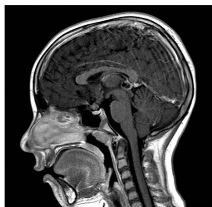
30 months later