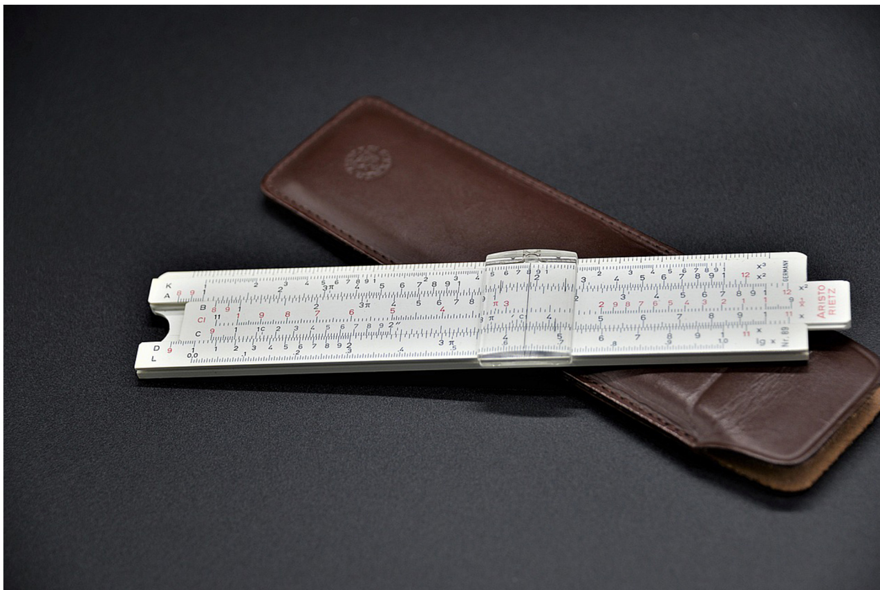
FIGURE 1 A slide rule.