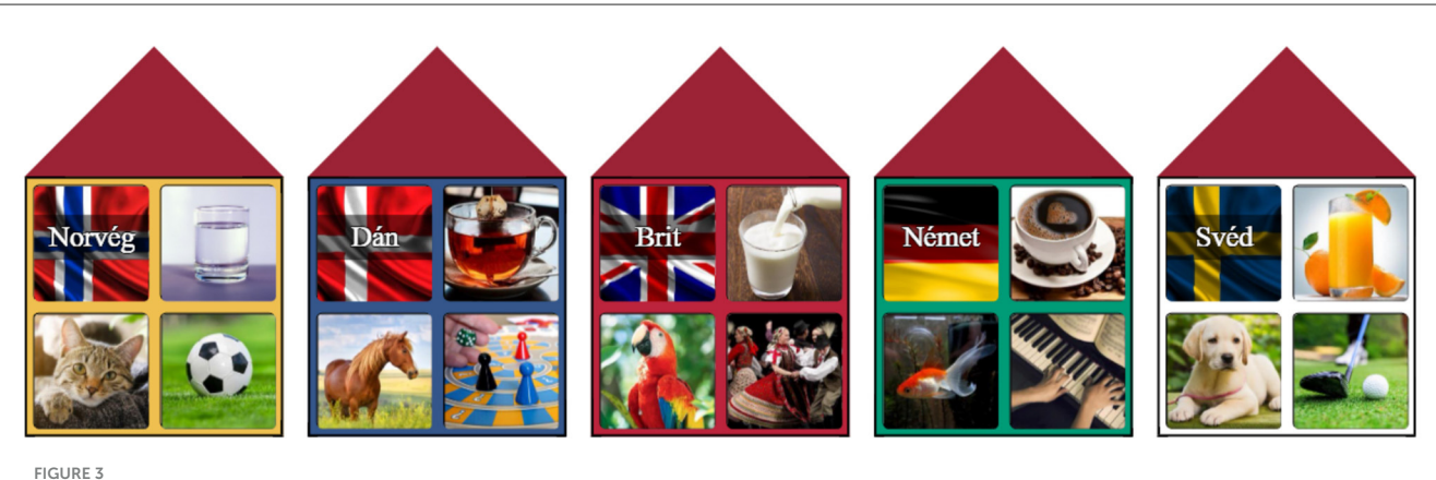
The solution for the house problem.