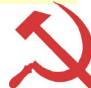
The hammer and sickle.