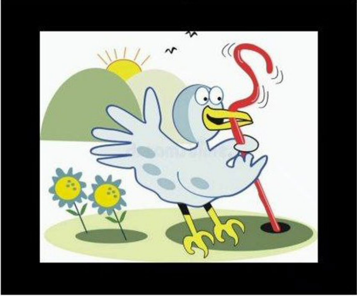
FIGURE 2 Sample of teaching materials which was used for teaching the participants in the experimental group.