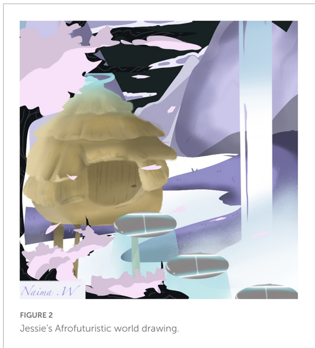
FIGURE 2 Jessie's Afrofuturistic world drawing.

over the mouth. In Mackenzie's explanation, she noted that this is the side that is typically depicted in textbooks, which communicates that Black people are not only shown as in pain, but lacking voice because they are absent or only shown in confined, minimal ways.