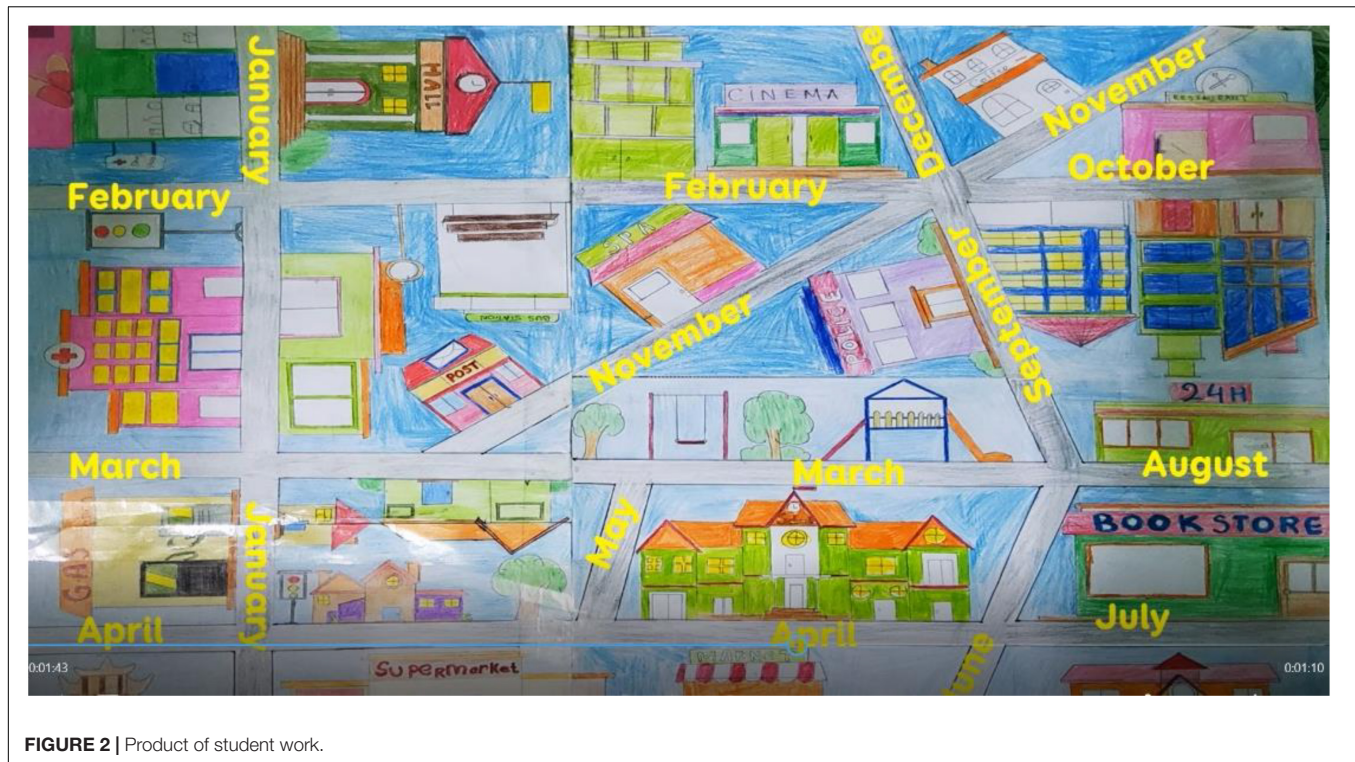
FIGURE 2 | Product of student work.

were performing at a high level, scoring highly on the criteria of positivity, enthusiasm for group discussions, and coordination among group members. All five groups consulted teachers on a satisfactory level. However, only two of the participants made the necessary progress, and only two gave good presentations in the experiment. Groups in the experiments were split into seven, with four groups meeting all the requirements, while three did not sound all that great. As a result, mathematics teachers in schools should employ the same tools used to assess competence: mind maps, a criteria sheet for evaluation, and research products created by students during learning activities. In particular, the math test questions are designed to assess the ability to apply previously learned knowledge and skills to solve real-world problems. Generally speaking, this is considered to be one of the most significant characteristics of the learner's competency assessment procedure.