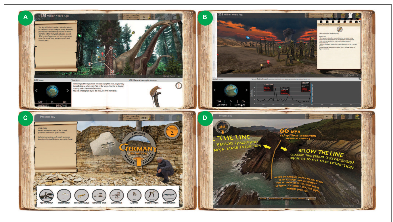
FIGURE 1 | Representative screenshots from Surviving Extinction. Panels (A,B) show some of the simulated environments while panels (C,D) show two of the real world sites.