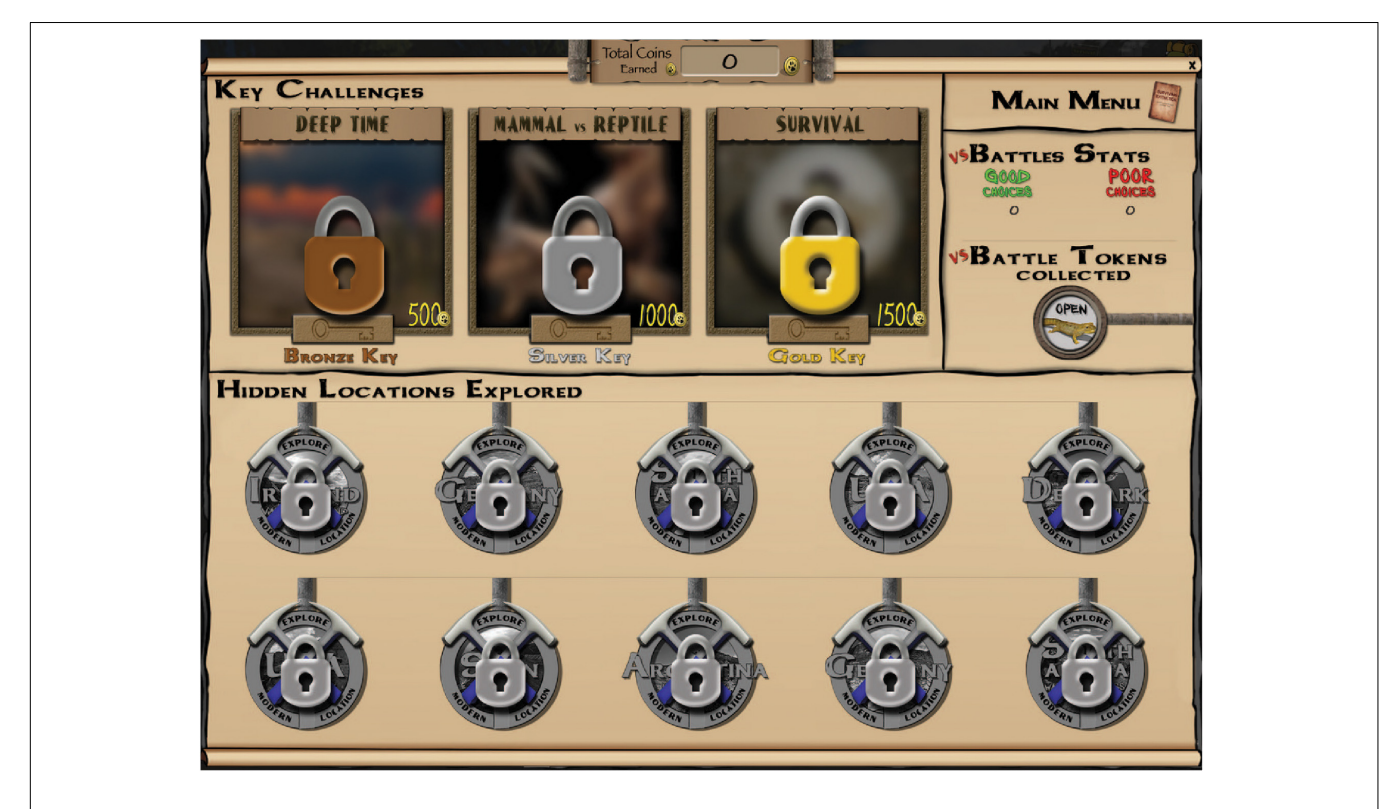
FIGURE 2 | A screen showing a student's progress through Surviving Extinction . This is shown just after starting, so none of the three challenge keys have been unlocked nor have any of the 10 real world locations been discovered.