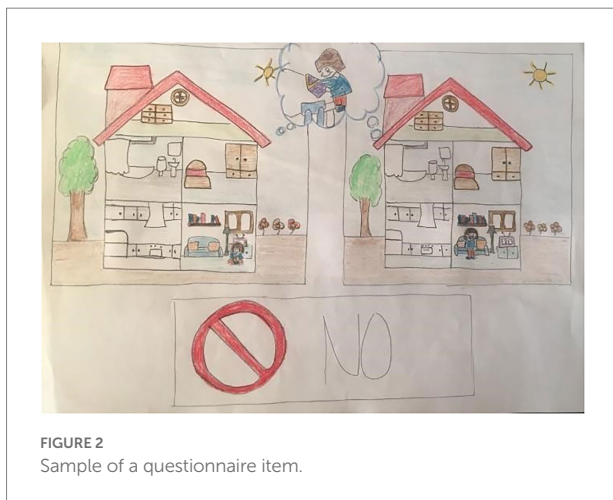
FIGURE 2 Sample of a questionnaire item.

instrument has been assessed giving a reliability of 0.87 (Cronbach's Alpha).