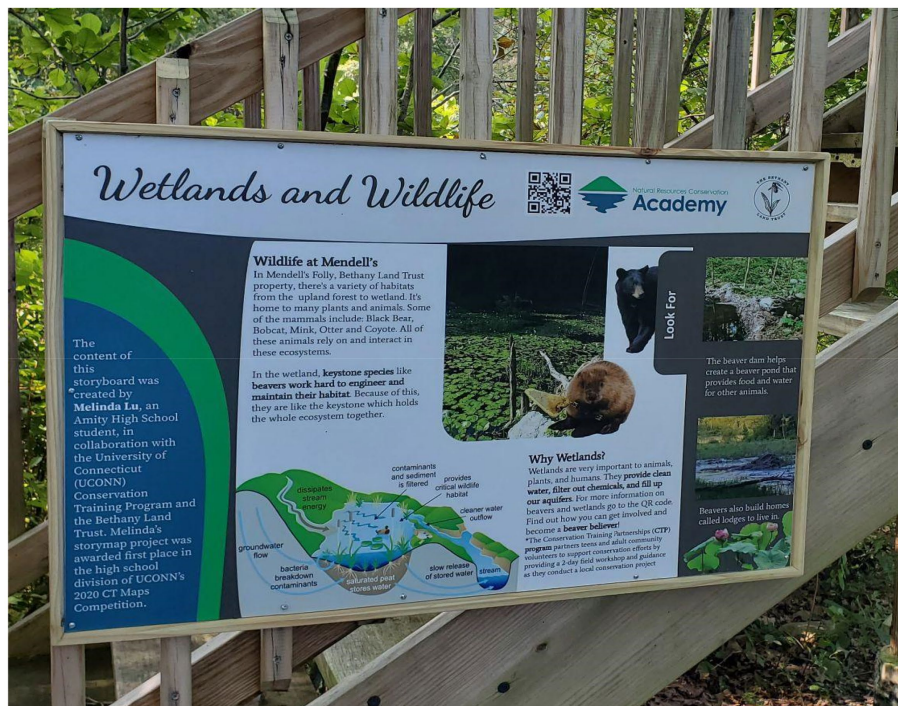
FIGURE 3 Mendell's Folly education sign.

sharing the story of the CTP program and its participants' experiences at the 2020 STEM For All Video Showcase (see CTP video at: https://stemforall2020.videohall.com/presentations/1788 ). In the end, the video showcase included almost 700 presenters and co-presenters who shared videos about 171 different projects. Additionally, 56,500 visitors from over 140 countries interacted with the video showcase over the week-long period, where there were over 6,000 discussion posts related to the 171 presentations. As further evidence of the video's positive reception, the CTP project video was named as one of 12 Public Choice award winners. The video showcase supported the CTP leadership team in accomplishing its aim of telling the story of CTP, while also providing a model of how DMD mentorship can help facilitate effective digital media storytelling. The video also afforded recognition to the program leaders and the DMD mentor/undergraduate in the same way the EDS approach aims to support the recognition of high school teachers and student pods as they seek to make a difference through developing ideas about the type of environmentally thriving community they want to live in and share those visions by engaging in environmental action projects.