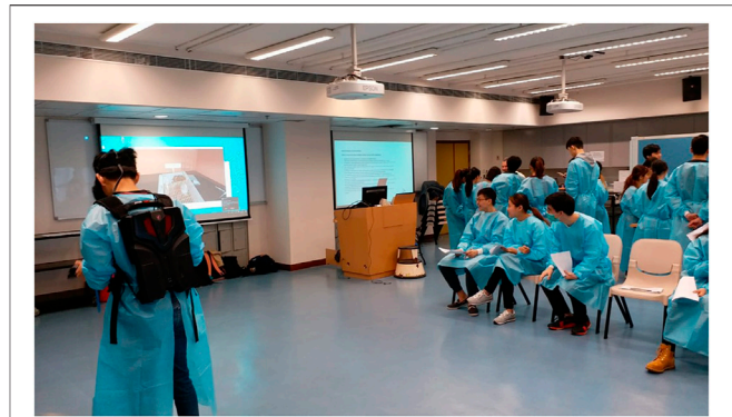
FIGURE 1 | The student player wore the VR gear and played the ViSi. The classmates sat aside engaged in the learning process by discussing the accurate or wrongdoing behaviours performed by the player.

VR can be broadly applied to modern pedagogical exercises supporting active learning processes and cognitive knowledge acquisition (Seaborn and Fels, 2015; Ngan et al., 2017). This is a novel study incorporating VR simulation to teach research technique in an undergraduate biomedical sciences program to the best of our knowledge. Our earlier work described the courseware development’s conceptual theory and instructional design (Tang et al., 2020). In brief, the courseware, named virtual animal holding gamified simulator (ViSi), is designed in the context of an animal holding facility, simulating the setting of