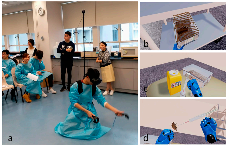
FIGURE 2 | The student player used the pair of the controllers for training the procedures of intraperitoneal injection to the mouse. The student player (A) concentrated on the game; (B) located the animal cage on the bench; (C) drew the drug from the bottle, and (D) held the mouse and performed intraperitoneal injection.

that their participation was entirely voluntary and would not affect their course assessment.