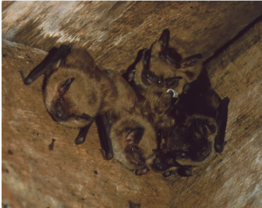
FIGURE 1 | Huddle of at least 7 Eptesicus fuscus bats in a home attic. Note the banded individual at the center.

During winter, big brown bats go into hibernation and find roosting sites such caves, mines, or basements that are well-ventilated but remain above freezing and usually close to 10°C (Whitaker and Rissler, 1992). During hibernation, bats have been found either hanging alone or in mixed-sex clusters. The ability of these bats to form dynamic colonies that gather repeatedly across the years, even after switching roost across seasons, speaks to the complexity of their social interactions and the need for a highly sophisticated communication system.