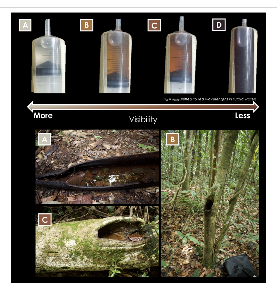
FIGURE 1 Water samples (collected by CF) from phytotelmata occupied by Dendrobates tinctorius tadpoles in French Guiana. Based on water samples, it appears that tadpoles are deposited in pools with a wide range of visibility. Colored labels refer the water sample (top of figure) to the pool from which it was collected. We hypothesize that in darker waters tadpoles' spectral sensitivity is red-shifted (lower Vitamin A1:A2 ratio).

composition in tadpoles versus juveniles of the frog Lithobates sphenocephalus (Schott et al., 2021). If these gene products were ones to affect light transmittance in a wavelength-dependent manner (e.g., Röll, 2001), the finding would argue against the speculation outlined just above, and highlight the need to explore the issue in more species to find -or rule- out potential patterns.