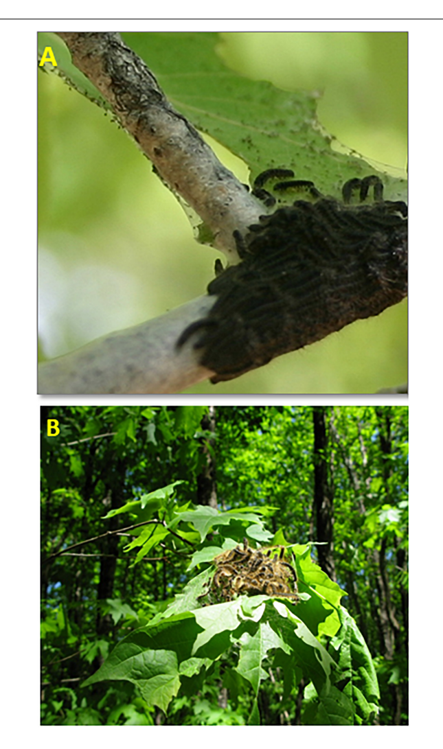
FIGURE 2 Thermoregulatory cooperation: Malacosoma disstria (A) second instar (body length 1–1.5 cm) and (B) fifth instar (body length > 5 cm) caterpillars basking collectively to increase body temperature in the boreal forest of Québec, Canada.

relationships between them clear (Regier et al., 2000; Zolotuhin et al., 2012). It has been suggested that gregarious larvae have evolved three separate times within the Lasiocampidae (Regier et al., 2000), but clearly much remains to be understood about the evolution of larval cooperation in this family and the role played by cooperative thermoregulation.